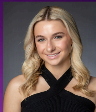
Kit Shell JANE SEYMOUR